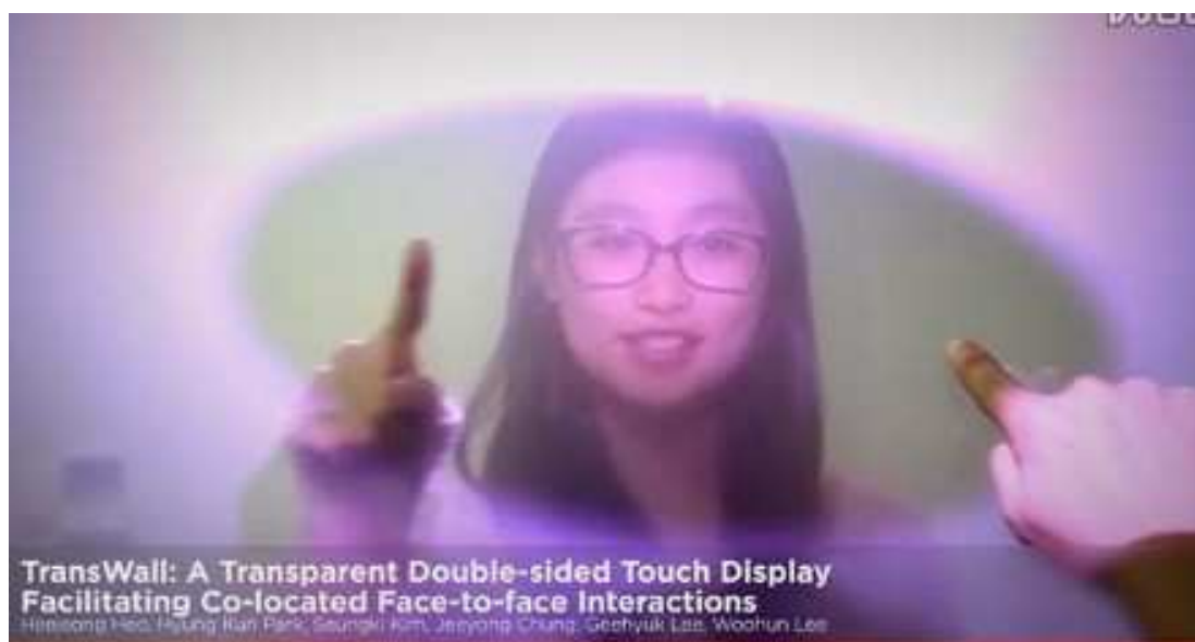
Figure 4 human-computer interaction

During web design, visitors are provided according to the interactive way to browse, designers design from the website's structure design to the navigation mode, should always consider how to provide good interactivity: whether the design of the home page is attractive: whether can better guide the visitors access to the site; Created web site is more in line with the needs of the visitor is shown in figure 4.