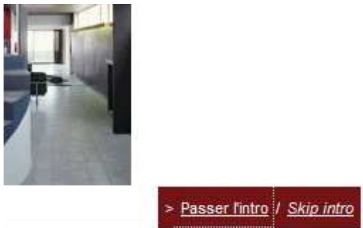
Figure 1 link structure

The directory structure similar with DOS, the home page link to the first page, first page link to the second page. Three-dimensional structure looks like a dandelion. For such link structure, enter and exit step by step. Advantage is clear, your visitors know where they are, don't get lost. Disadvantage is low browsing efficiency, a section of child pages to another section of child pages, must be over the front page, as shown in figure 1.