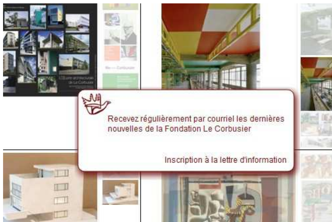
Figure 2 a one-to-many

These two basic structures are ideal way, in the actual web site design, the two structures are always get mixed. We hope that visitors can conveniently quickly get to the page they need, and clearly know their place.