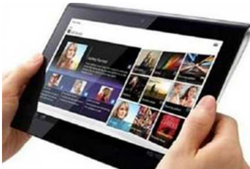
Figure 6 "fool" web interface

Site design's goal is information's better conveying, but if users have too many choices, the user is easy to confuse and difficult to get information on demand. Analysis of the user interface essence is also based on the analysis of users, psychology of business purpose. At this time, the efficiency is higher than all in the modern commercial society, what could be more comforting than convenient user of relief、 help plan? We designers should try to planning and design more concise and practical "fool" web interface as shown in figure 6 in future.