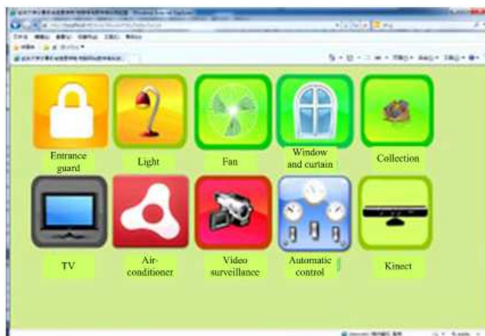
Figure 1. Control Pages of Smart Office System

The recognition of gesture tracking is necessary for the control of smart home system and the author adopts the gesture tracking recognition based on Hidden Markov Models in this paper. Firstly, obtain depth information of images through Kinect sensor, then determine the palm position through the hand analysis module of OpenNI and abstract the tracking features, finally train the effective tracking samples and realize tracking recognition according to Hidden Markov Models.