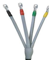
Fig.2 after installation products