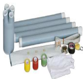
Fig.1 The product installation materials