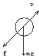
Figure1: Tennis force schematic diagram

Tennis flying instant, except for air resistance impacts, it also suffers gravity impacts that vertical to ground, as Figure 1 show: