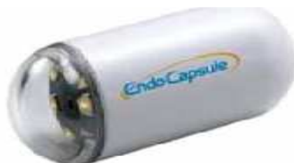
Fig :2 Endo Capsule of olympus

It provides magnetic propulsion. The main aim of the designing this type of capsule is to administer drug directly to the affected area. In Olympus new release capsule a body fluid sampling system is present that takes sample of the body fluid for diagnosis and analysis.