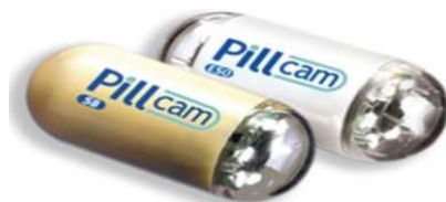
Fig 1: Swallowable Camera capsule