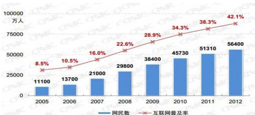
Fig.1: Size of China Internet users and Internet Penetration rate

Since the establishing of Internet in 1982, it has been developing at a surprising speed and swept across the whole world. Into the 21st century, the Network has penetrated into all aspects of social life, and has changed modern life. Communication and information dissemination of mankind has turned from the initial stage of body language into now the network-era. While the widespread of Internet gives birth to a new kind of language —Netspeak: the language on the Internet which is a new linguistic phenomenon with the spread of the Internet. It becomes more and more popular, which is created by millions of thousands of netizens and widely used in cyber chatting rooms and on BBS. Netspeak soon becomes the main language and the major communicative means online, therefore the Internet is not only changing mankind's life concept, life condition, and also life style. The following figure indicates the development of Chinese netizens from 2005 to 2012. (All data in it come from the 31st Statistical Survey on Internet Development in China Internet Network Information Center)