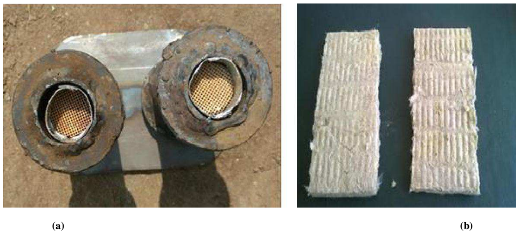
Figure 2: a) Two set of concentric tubes with ceramic cordierite substrate inside, (b) Rockwool insulation

Two concentric tubes of diameter 32mm and 44mm, both having the length of 14cm were taken and were welded by keeping the smaller tube in the larger tube and the annulus was produced between the tubes. 250g. of Mg_7OZn_{24.9}Al_{5.1} alloy was filled in the annular region and both sides of the annulus were closed. This assembly of tubes and ceramic material is heated to 600^{\circ}C in the muffle furnace and kept at 600^{\circ}C for one hour and removed from the furnace. Rockwool insulation of 20mm thickness is provided around the larger tube. Honeycomb like ceramic cordierite (which is widely used as the substrate on which catalyst is coated) were made into the small cylinders and kept inside the smaller tube. Temperature of ceramic that is kept inside the tube is measured using IR thermometer gun at periodic time intervals.