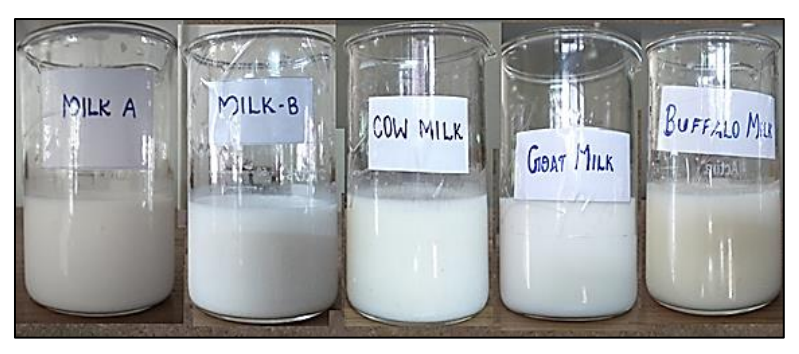
Figure 2: Milk samples