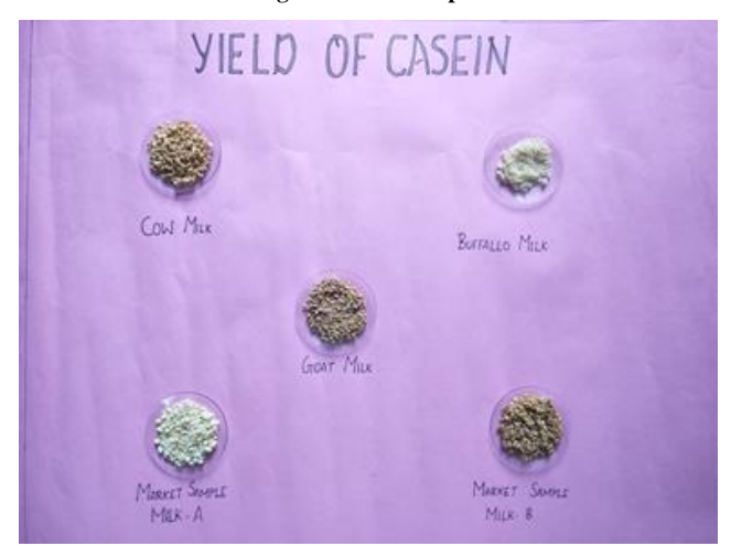
Figure 3: Yield of casein