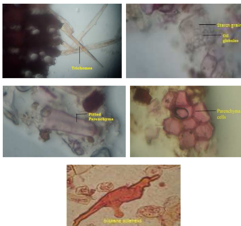
Fig 3: Powder Characteristics of Ardisia solanacea Roxb. Root Stocks

The powdered root stocks were fibrous and light brown in colour with characteristic odour and bitter in taste. On microscopic examination, the powdered root stocks showed the presence of simple starch grains; unicellular, uniseriate trichomes; parenchyma cells were in rectangular or squarish in shape, had thin walls and wide lumen. Most of the parenchyma cells possess some kind of cell inclusions. Vessel elements were mostly elongated and cylindrical. They had wide, simple, horizontal perforations at the end walls. Their lateral walls had either close spiral thickenings or dense elliptical bordered pits and shown in Fig 3.