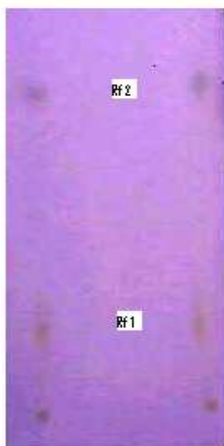
Figure 2-Spots in Day Light

+ Presence of constituent, - Absence of constituent