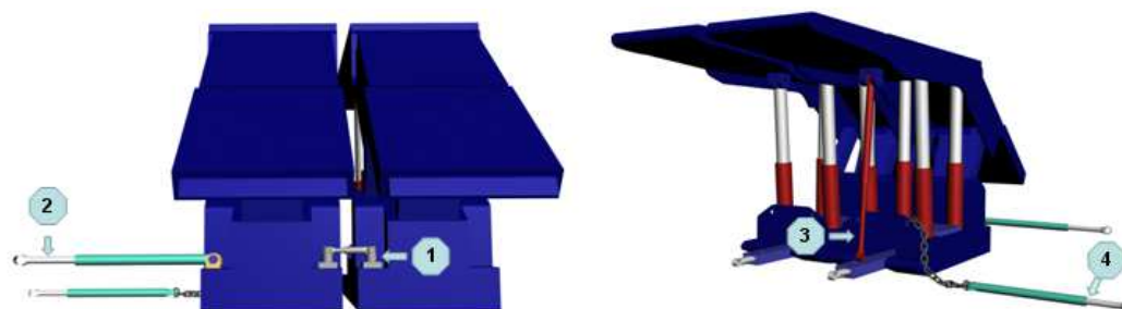
① bottom adjusted cylinder ② Pull the rear conveyor device ③ compression bar cylinder ④ Pull the front conveyor device

The specific effect of the design is shown in figure 3.