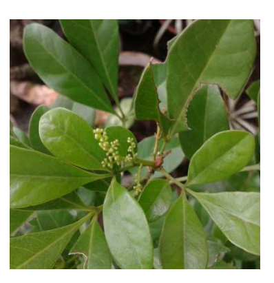
Figure 1. Pictures of Aglaia Odorata L