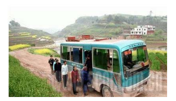
Fig. 4: Passenger travel by medium-size bus