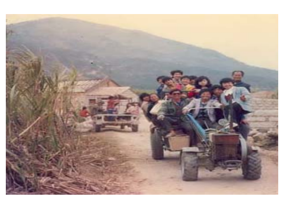
Fig.5: Passenger travel by tractor