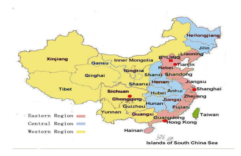
Fig. 7: Regional division of china

In the eastern region, rural manufacturing enterprises mainly are located in townships [9]. Rural roads connect townships with external road networks to allow convenient transportation of these enterprises' goods. The central and western regions attempt to attract enterprises that suit their own features, which are leading producers of agricultural commodities in China and have agricultural acreage that accounts for 37% and 38% of Chinese totals, respectively, in 2012 [1]. For this reason, the central and western regions have an advantage to build businesses that process goods from farms. In addition, the central and western regions have the majority of China's 45 types of minerals' reserves (accounting for 44.8% and 39.7% of China's totals, respectively [11]). To have a resource-focused economic development, the central and western region can build plants to process mineral resources. Furthermore, in the central and western region, the geography is diverse and the urbanization level is low. Plentiful natural and historic landscapes are near or in villages, so these areas can attract city residents for tourism. The rural dwellers can raise their income by providing food and beverage services and selling native and special products to tourists.