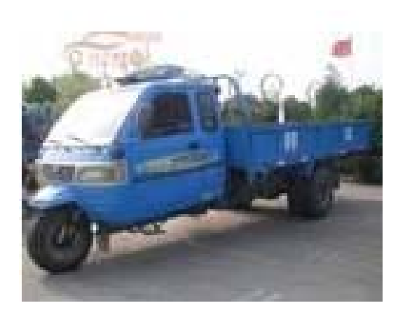
Fig.6: Three-Wheel vehicle