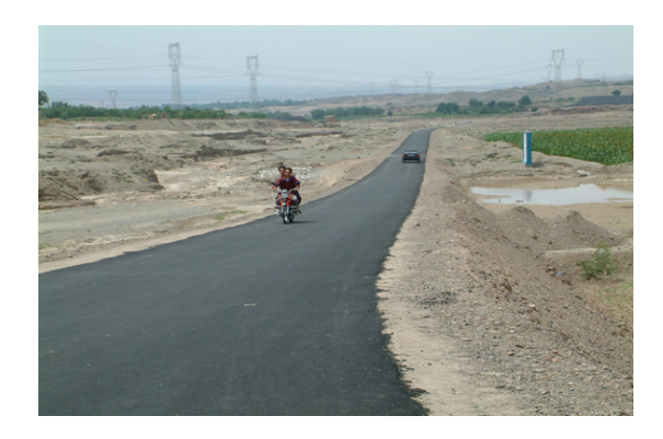
Fig. 3: Chinese rural road (Gansu province)

Medium-sized passenger buses are used by rural bus companies for passenger transportation (shown in Figure 4). As a result of low travel frequency of rural dwellers, the income of rural companies is poor, some towns and administrative villages are not served with passenger buses. In these cases, rural dwellers usually travel by motorcycle or tractor (shown in Figures 3 and 5). There are two types of vehicles used in rural areas to transport goods. One is heavy trucks to transport large quantities of goods. The other is three-wheel vehicles to transport small quantities of goods (shown in Figure 6).