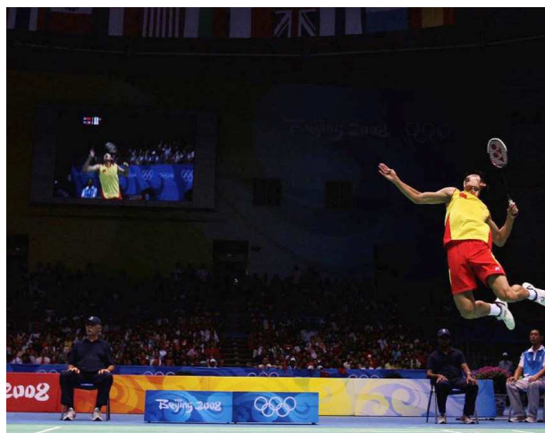
Fig.3: The badminton sports