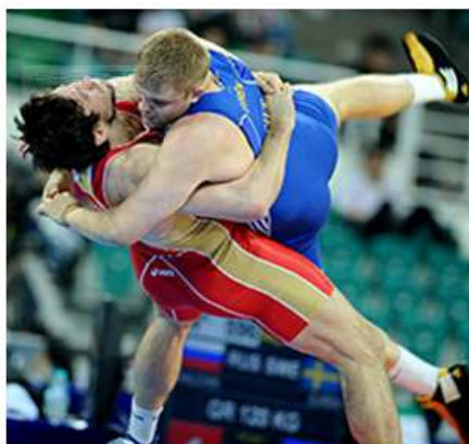
Fig.2: The wrestler sports

Reasons for different sports and different training methods fatigue are different, so the regeneration methods are also differences. Wrestling is the power of sports, fitness and nutrition project athlete relationship is very close. Specifically, a balanced diet means that while athletes make in four areas between dietary nutrient supply and establish a balance between the body's physiological requirements, namely amino acid balance, heat balance of nutrients constitution, and a variety of acid-base balance between nutrient intake balance, only that help absorb and use nutrients for optimum ratio of the chemical composition of the human body to maintain. During exercise, the body needs more energy intake and oxygen consumption increased, which led to an increase in free radicals will be doubled, to reach up to a thousand times. The body had to consume large amounts of antioxidant vitamin E to repair the extra free radicals. Therefore, food and nutrition experts suggest: athletes after high-intensity exercise is best to take the right amount of vitamin E supplements and foods rich in vitamin E, wheat germ, wheat germ products. Wrestling requires greater strength and coordination of the nervous system, and requires a short time to produce explosive force, making this type of movement severe hypoxia, and oxygen debt is greater than the nitrogen metabolism strong [Watson, 2005]. Fig.2 shows wrestlers sports.