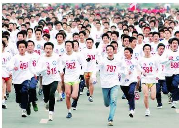
Fig.4: The long-distance running sports