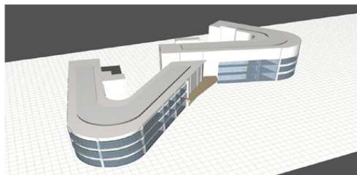
Fig.4 Using CAD architectural building information modeling