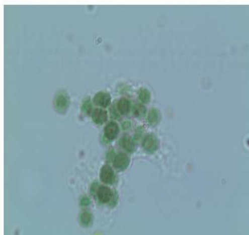
Fig 1. The photograph shows morphology of C-1 (chlorella vulgaris) strain.