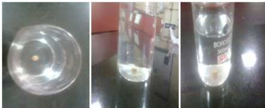
Fig.3 No tablet floats on water

The tablets were evaluated for buoyancy lag time (BLT), Total Floating Time (TFT), matrix integrity after floating by placing in 500 ml of distilled water [5]. The tablets did not float even after 30 minutes and started disintegrating after 1 hr (Fig.3).