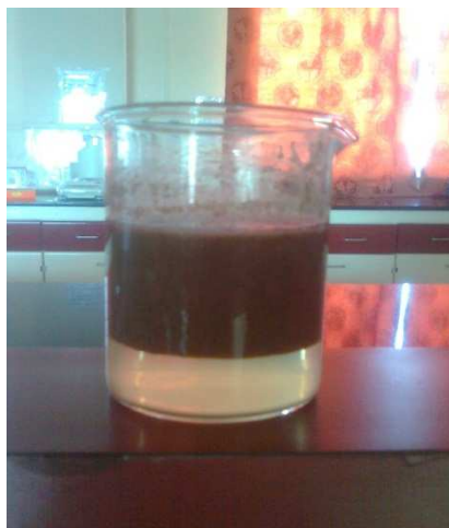
Fig.1 Mucilage floating on the water surface

For proving its floating property the present study was undertaken. Diltiazem HCl, a potential candidate for gastro-retention, was selected as model drug. Compatibility of mucilage and drug was determined by performing Differential Scanning Calorimetry (DSC) (Mettler) [3] and Fourier Transform Infrared Spectroscopy (FTIR) (Jasco 4100) [4]. The spectra are shown in Fig.2. The drug was found to be compatible with mucilage for use in our study.