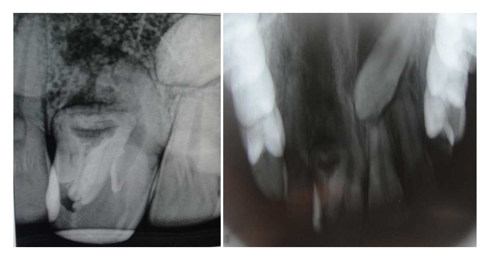
Figure 4- Pre operative IOPAR (intra oral periapical radiograph & occlusal radiograph)