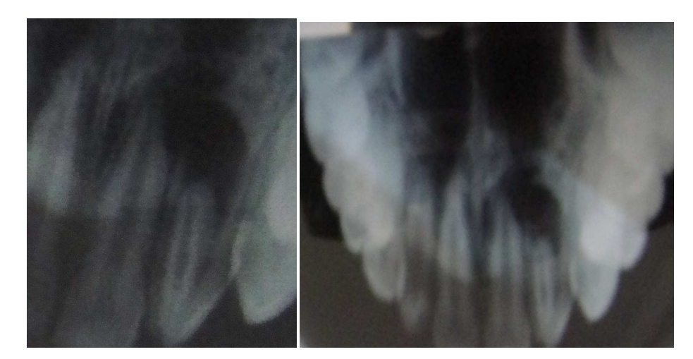
Figure 2 - Pre operative IOPAR (intra oral periapical radiograph & occlusal radiograph)

■ A 25 year old male patient reported to department of dental in VID & RC with the chief complaint of discolouration of the tooth of the maxillary right central incisor. No previous history of trauma. History of pain and swelling had been present intermittently for last 3 months. On examination morphologically tooth was large in size, discoloured, rotated and extruded. On palpation tender on percussion is noticed with grade I mobility. Periapical radiograph revealed the presence of a dens invaginatus type II with 11, with a abnormal root morphologically and open apex in tooth associated with a large periapical radiolucency. Vitality Testing= 11(No response on thermal testing). Diagnosis was made as Dens Invaginatus type II with 11 necrotic pulp and a periapical abscess. Hence endodontic treatment was recommended with 11 followed by apicocurrettage and retrofilling.