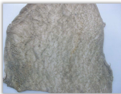
Fig. n°1: camel skin after deliming