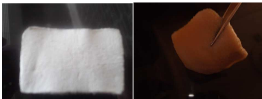
Fig. n°2: camelin protein semi finished Fig. n°3: camelin protein - finished product