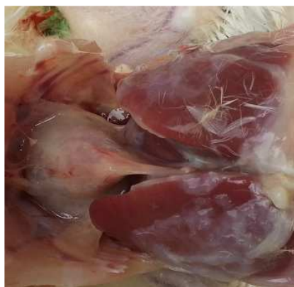
a. Severe pericarditis and perihepatitis

Through pre-experiment for dosage determination, the dosage for injecting was determined to be 5.6 \times 10^7 CFU/ml. After being injected bacteria, broilers showed typical clinical symptoms such as severe diarrhea, lassitude, fever, loose feathers, necking lethargy, two wings droop. All broilers which died in experiment period were conducted necropsy. When their enterocoelias were opened, it smelled stench. And pericarditis or perihepatitis in different extent appeared, shown as Figure 1. Heart and liver were collected to isolate and cultivate pathogens in laboratory. In the early stage of the experiment, Escherichia coli were advantage bacteria. Till late stage of the experiment, Salmonella was the advantage bacteria.