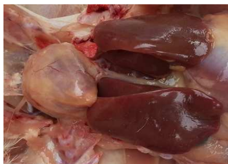
c. Pericarditis, liver has water and punctate exudates