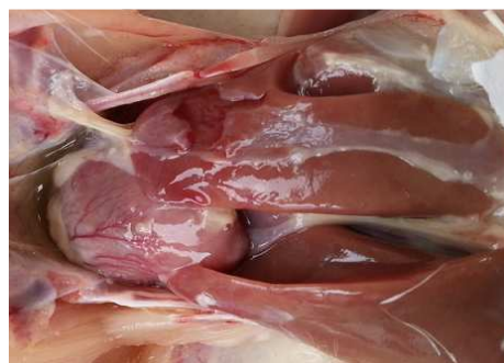
d. Pleural effusion, pericarditis and mild perihepatitis