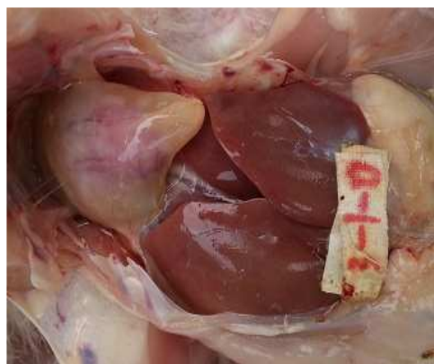
b. Liver is normal but heart has pericarditis