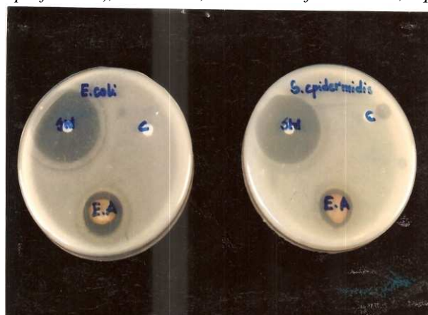
Fig. 2: Antibacterial activity of ethyl acetate extracts of powdered leaves of Plumeria rubra L. [Std.: Standard (Ciprofloxacin), C: Control, E.A.: Ethyl Acetate]