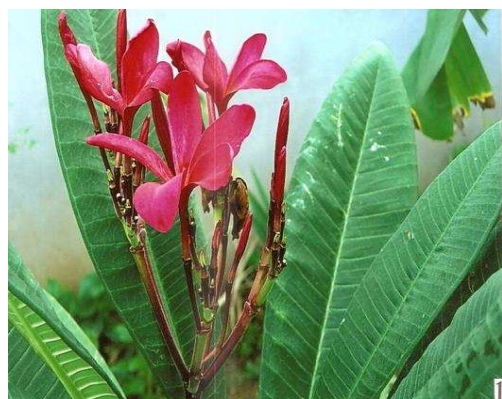
Photograph of Plumeria rubra Linn.