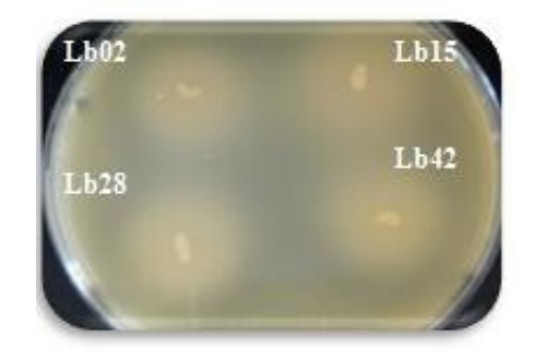
Figure 1. Inhibition of Penicillin-resistant S. pneumonia (PRSP) by Lb. casei strains

The inhibitory effect, which was observed by the formation of clear and distinct zones around the colony of the producer strain, may be due to the production of several antibacterial compounds; organic acids, H2O2 or bacteriocins [18]. No strain has inhibited Candida albican .