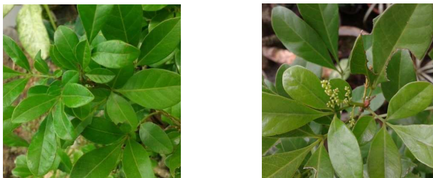
Figure 1. Pictures of Aglaia Odorata L