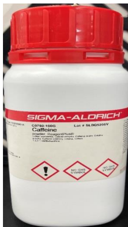
Figure 1: Sigma-Aldrich caffeine used in this experiment

For the low dose group, we added 12 mL of caffeine stock solution into the 700 mL water; for the medium dose group, we added 20 mL of caffeine stock solution into the 700 mL water; for the high dose group, we added 28 mL of caffeine stock solution into the 700 mL water (Figure 1).