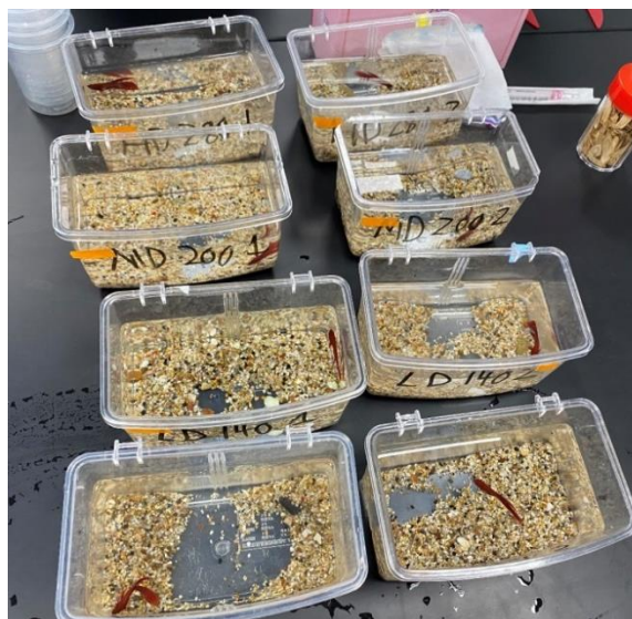
Figure 2: Betta splendens samples used in this experiment

Conducting the Experiment-Before experimenting, we allowed the territory holder fish to rest (meaning they did not have any contact with other fish) for 24 hours in the water with each respective caffeine concentration. The intruders also rested for 24 hours with regular tap water (without added caffeine). After the resting period of 48 hours, we obtained a territory holder and an intruder fish and placed their fish tanks side by side so they could see each other. We observed their behaviors for a total of 5 minutes with 10 seconds in between recording the aggressive behaviors of the fish with a check mark, each indicating that the territory fish has exhibited a specific aggressive behavior. Each experimental group was repeated for two trials. After repeating this process for all four experimental groups, we used a t-test to see the differences in behavior between the control fishes and the fishes with varying caffeine doses (Figure 2).