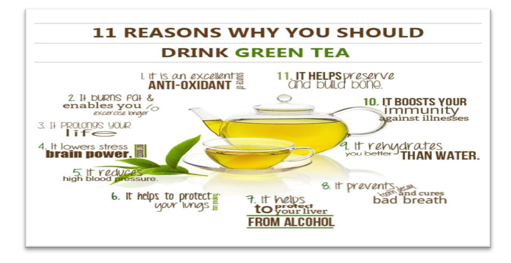
Figure 2: Overview of green tea Uses

Recent animal studies have revealed that green tea catechins could inhibit key enzymes involved in lipid biosynthesis and reduce the intestinal absorption of TC, thereby improving blood lipid profiles [25-26]. Because of promising results in preclinical models, a substantial number of clinical trials have been per- formed to investigate the effect of green tea beverages and extracts on lipid profiles of subjects with cardiovascular-related diseases as well as of healthy individuals [27-29]. However, results of these trials were inconsistent, and sample sizes were relatively modest. As a result, the precise effect of green tea on lipid profiles has not been established to our knowledge. Therefore, we conducted a meta-analysis of all published randomized controlled trials (RCTs) that investigated the effects of green tea on blood cholesterol, including TC, LDL cholesterol, and HDL cholesterol.